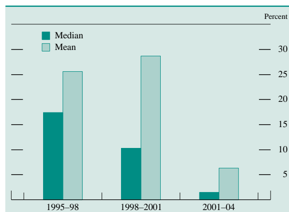
2. Change in median and mean net worth, 1995–2004 SCF

SOURCE: Federal Reserve Board, Survey of Consumer Finances.